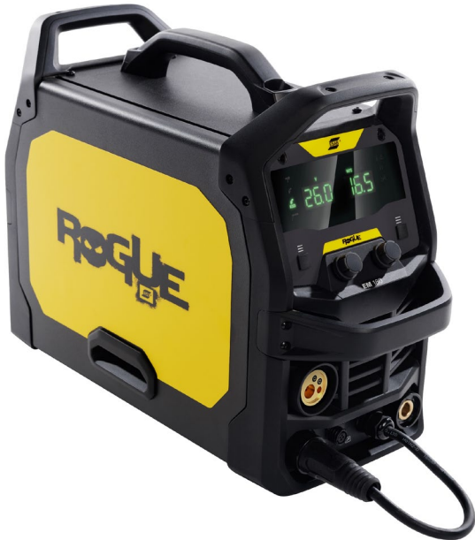
Rogue EM 180

ESAB Rogue EM 180 is an inverter-based MIG welding system designed to address all your welding project needs, from light fabrication to repair and maintenance. The system features industrial-grade arc performance and full featured controls that allow the welder to fine tune arc characteristics based on the material they are welding.